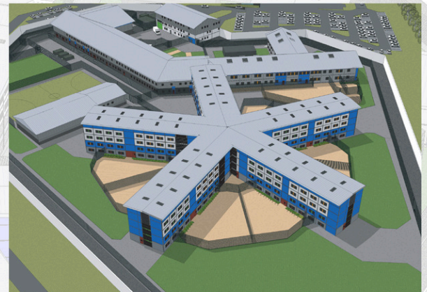
VIEW OF HOUSEBLOCKS