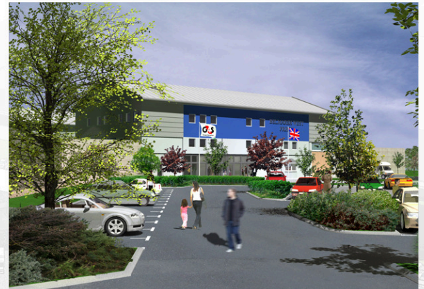
IMPRESSION OF ENTRY BUILDING

The proposals include an Energy Centre outside the prison boundary wall utilising sustainable / renewable resources.